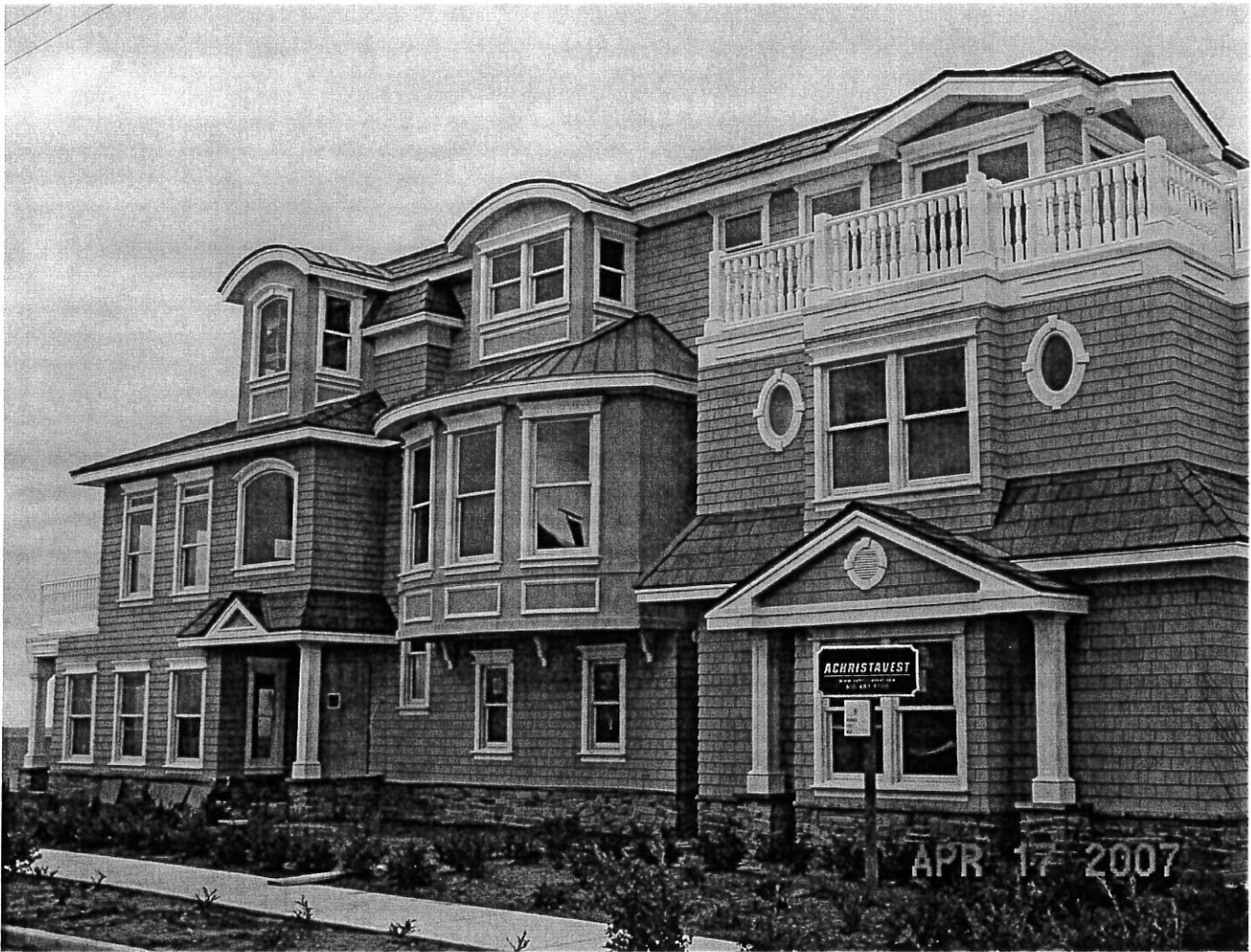
VIEW : FRONT

If using the Elevation Certificate to obtain NFIP flood insurance, affix at least two building photographs below according to the instructions for Item A6. Identify all photographs with: date taken; "Front View" and "Rear View"; and, if required, "Right Side View" and "Left Side View." If submitting more photographs than will fit on this page, use the Continuation Page, following.